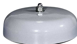
CEAD 165 G CEADEL 165 G CD165G CDL165G