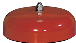
CEAD 165 R CEADEL 165 R CD165R CDL165R