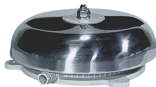
SIAD 215 NAVE STSD215N